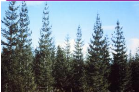
Naturally established western white pine outgrowing common douglas in the Drier Maritime CWH subzone on Southern Vancouver Island