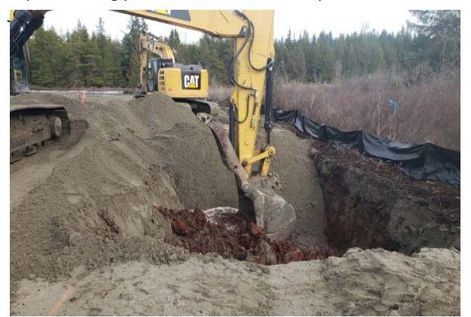
S4: Hwy 91 East Side - Full peat excavation underway at toe of fill. Taken January 26, 2021