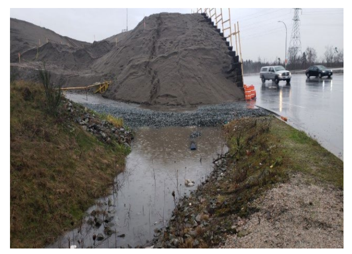
S2: Hwy 17 EB > Hwy 91C EB – Some on-site ponding with the increased rain. Taken January 8, 2021