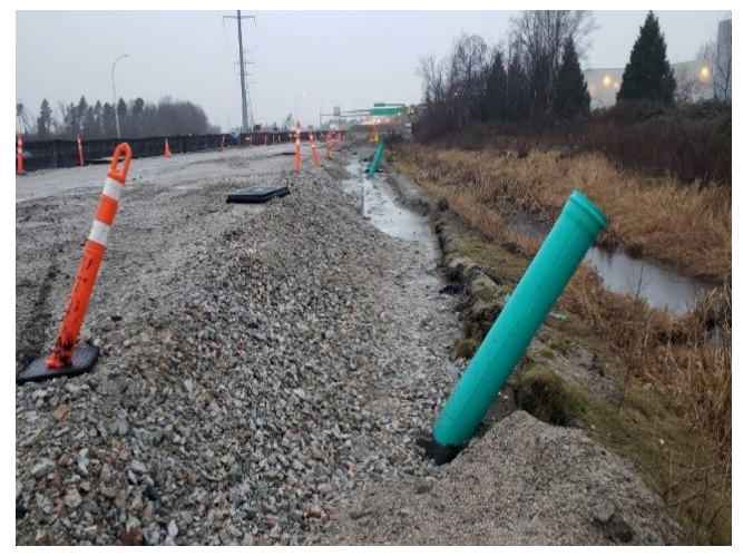
S3: Hwy 91C – Northern limit of construction interface with existing East-West ditch. Taken January 4, 2021