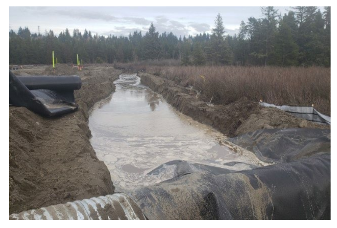
S4: Hwy 91 East Side – Width of excavation along toe of fill. Taken January 29, 2021

HIGHWAY 91/17 UPGRADE PROJECT Monthly Status Report – January 2021