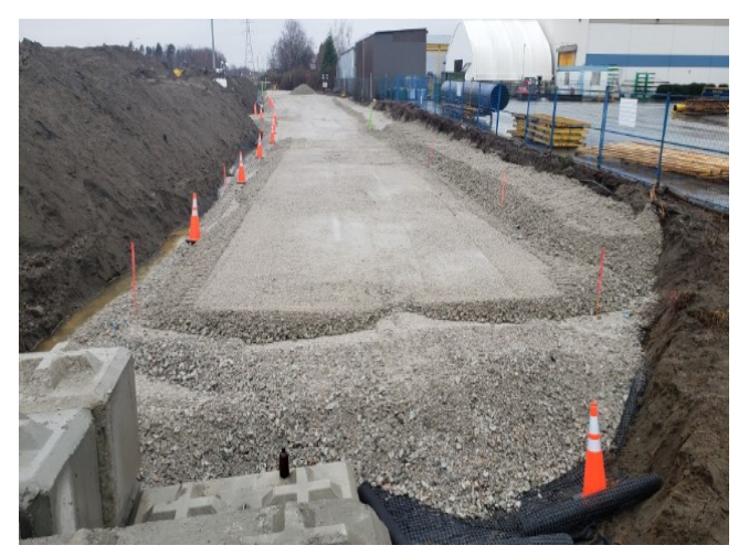
S3: Hwy 91C North - Lifts of 3" road sub-base placed as preload. Taken February 1, 2021