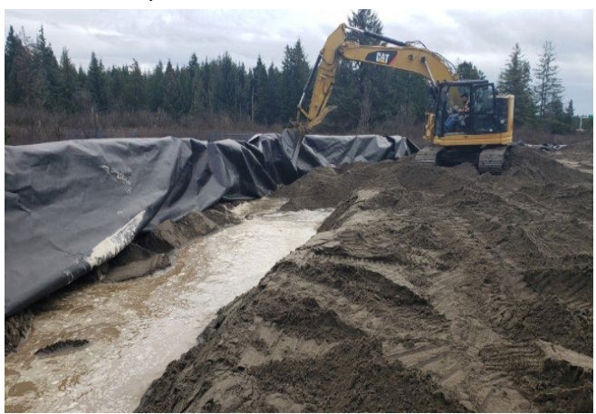
S4: Hwy 91 East Side – PGC laying the geomembrane within the toe kick excavation and backfilling. Taken February 22, 2021