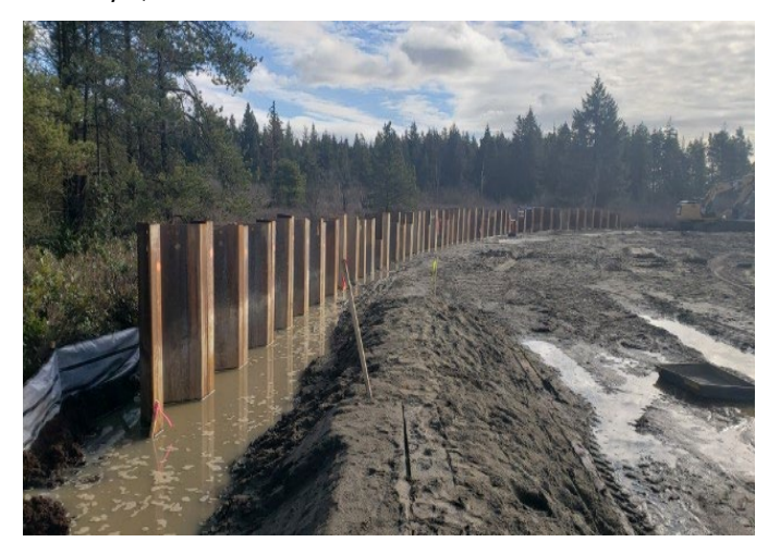
S4: Hwy 91 East Side – FRPD have completed the temporary sheet pile wall installation. Taken February 16, 2021