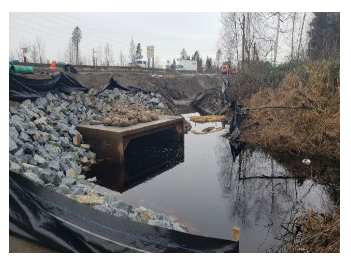
S2: Hwy 17 West – Box Culvert at 96 St. Ditch. Taken February 4, 2020