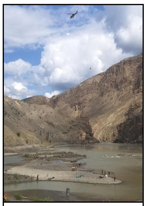
Salmon in oxygenated holding tanks being transported upstream via helicopter.