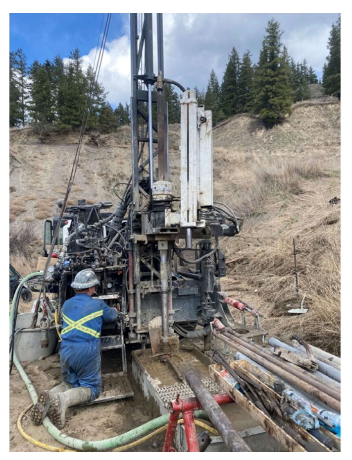
Crews used drill rigs in the Soda Creek-MacAlister Road Project area to collect soil and water samples, which informed options analysis.