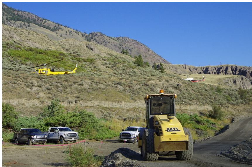
Salmon can now be moved by road after a successful trial run.