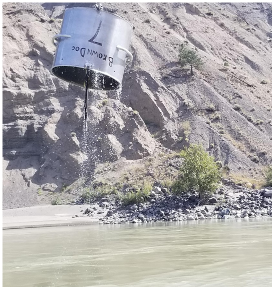
A helicopter unloads salmon above the slide.