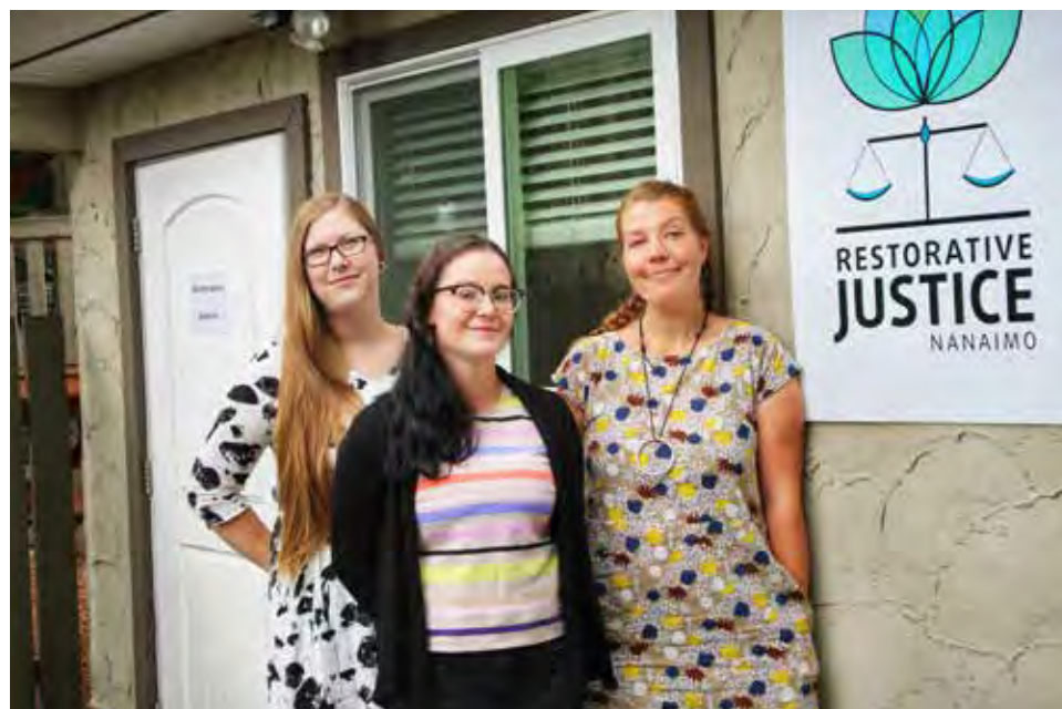
John Howard Society Nanaimo: Restorative Justice Program.