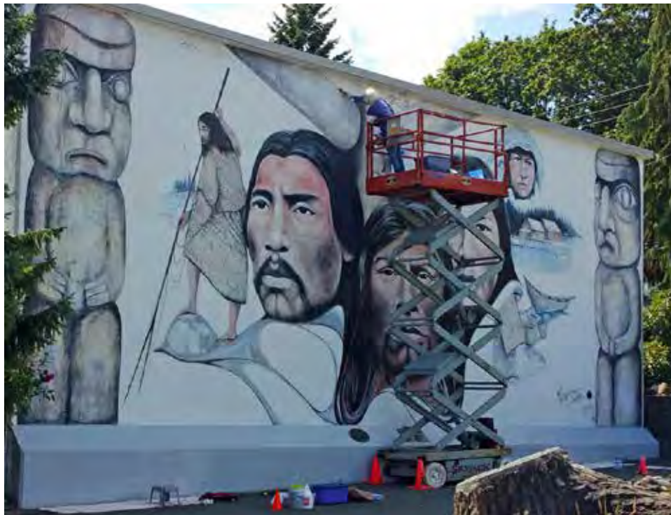
Chemainus Festival of Murals Society.

Generally, there can only be one regional organization by sector/sub-sector. Regardless of the local, regional or provincial status of an organization, each application is assessed on its own merit, based on the size and scope of the programming presented.