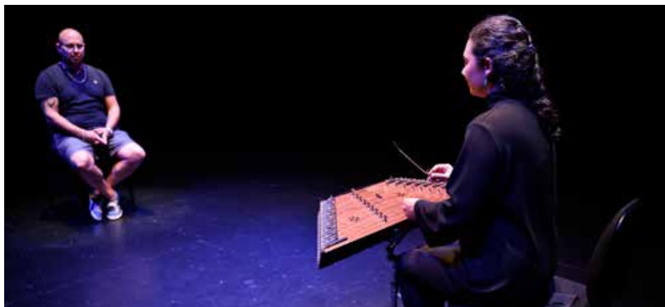
Music on Main Society.

If an organization is unsure which sector their program(s) fall within, the application should be submitted in the sector that aligns most closely with the organization's purpose(s), as outlined in the constitution, or with the majority of the organization's eligible programming.