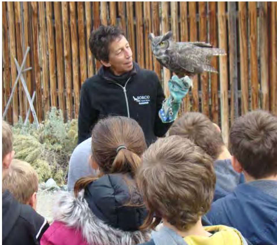
South Okanagan Rehabilitation Centre for Owls.