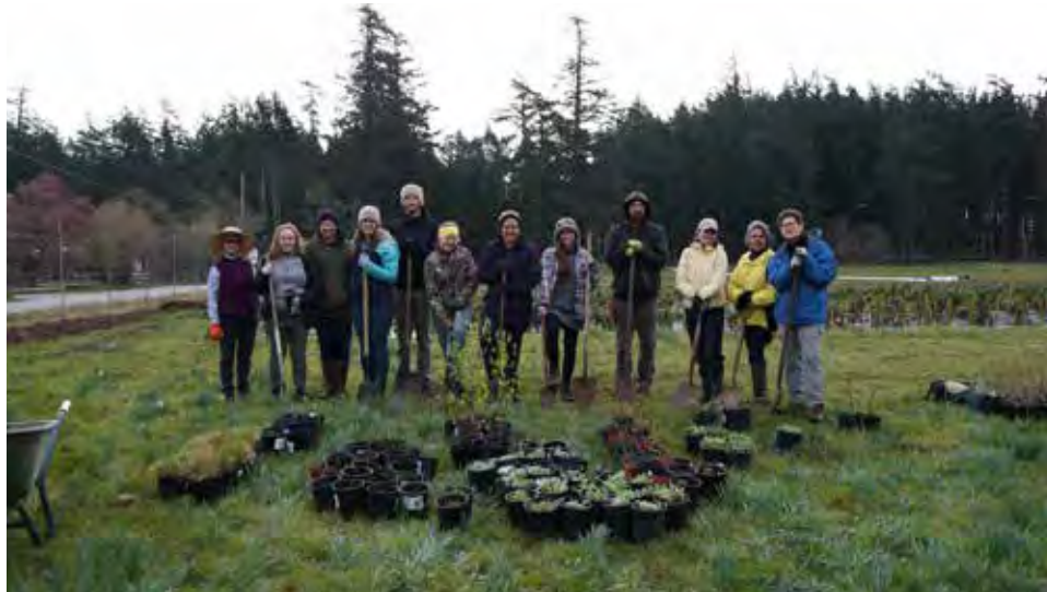
Habitat Acquisition Trust.