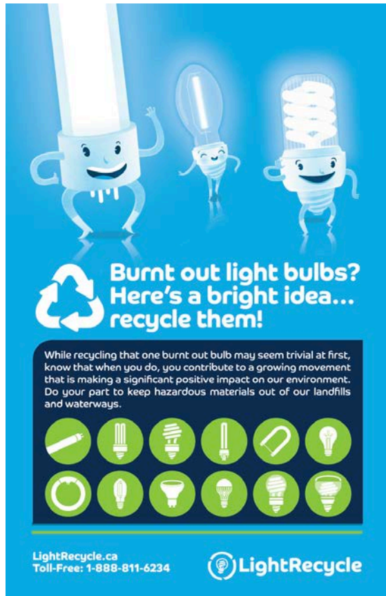
Consumer Awareness Poster – 11x17