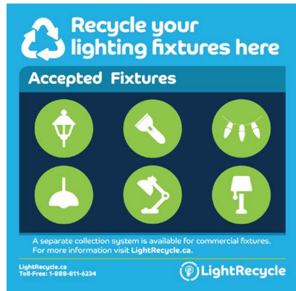
Fixture Collection Site Sign – 24 x 24