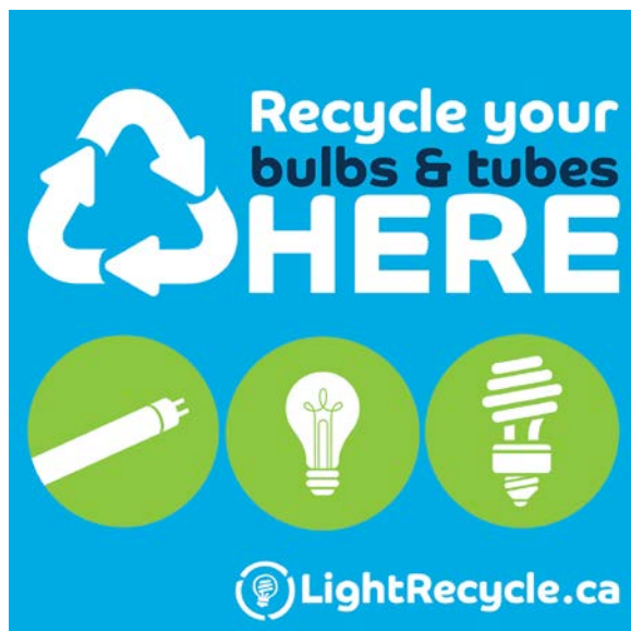
Roadside Lamp Collection Site Sign – 24 x 24