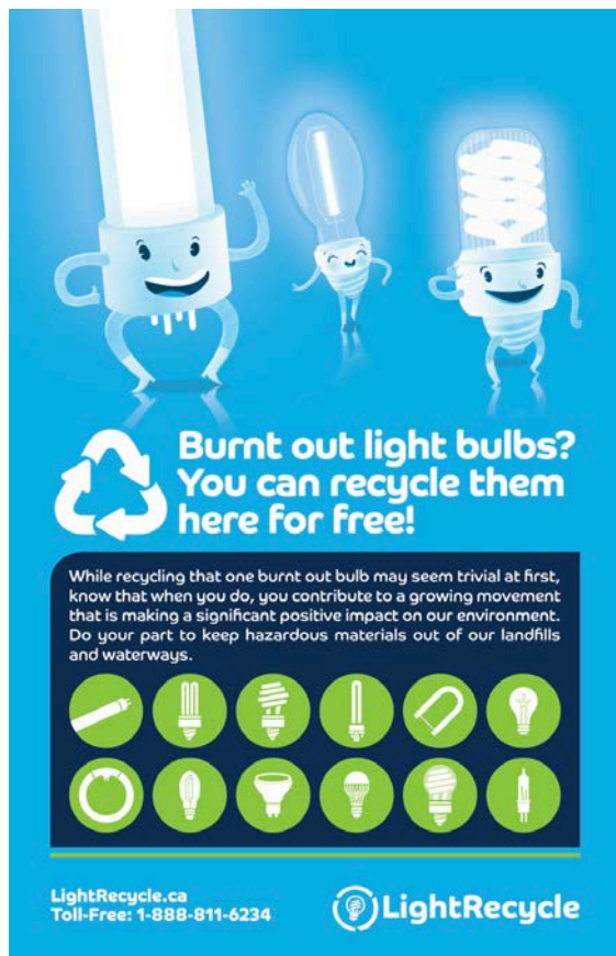
Retail Poster – Available in 11x17 and 18x24 (Large Format)