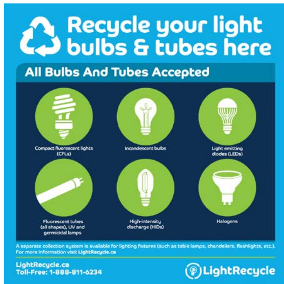
Lamp Collection Site Sign – 24 x 24