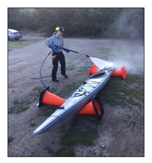
Penticton (top) and Laidlaw inspection crews (bottom) performing decontaminations on high-risk watercraft which includes non-motorize boats such as canoes and kayaks.