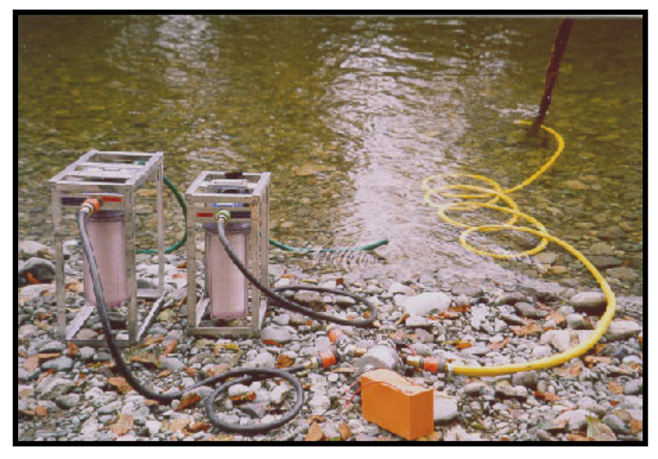
Figure 1. Configuration of apparatus for splitting G/C samples.

A single sample can be split between filters in order to obtain identical samples. These samples are used to test the variability between laboratories or the consistency within a laboratory (Cavanagh et al. 1996). An effective device for splitting samples is shown in Figure 1. This configuration requires two additional hoses – one from the pump to the second filter housing, the other as an outlet. Only one intake hose and pump are required (flow rate is reduced). Using an in-line "Y" allows the source water to be randomly divided between two filters. If the filter housings are placed at the same height, the flow rate will be the same through both filters. Flow rates can be also be adjusted by valves in the "Y".