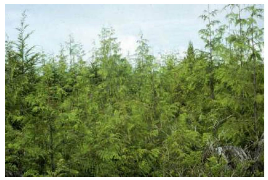
Figure 5. Pure even aged redcedar stand that is on a trajectory to provide desired characteristics.

objective. Will other approaches create similar desired outcomes? To some extent time will provide the conditions that create clear wood and large trees. The assumption is that most stands will have some healthy cedar and with enough time the trees will provide for the desired characteristics. When natural regeneration is relied upon in areas of low ground disturbance, much of the regeneration will be vegetative and have internal rot, this may not be a wise assumption.