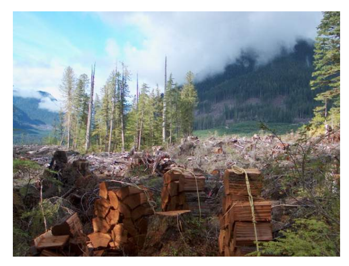
Figure 2. Cedar bolts to be used for shingles or shakes. Note the retention of redcedar in the group behind. Second growth trees will not have the characteristics of these large old trees, no matter how they are grown, unless rotations are lengthened.

The aesthetic quality of redcedar is often derived from its reddish color, grain pattern and wood free from knots. Similar to the issues on durability second growth redcedar will often have reduced heartwood and have limited clear wood unless managed specifically to create these desired characteristics of grain and color.