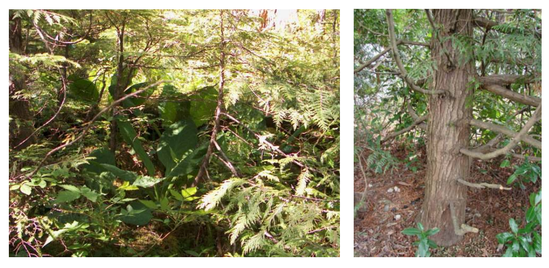
Figure 4. Note the wide low crown extending to the ground in the understory redcedar. Also note the size and longevity of branches in an open grown redcedar on the right. This form does not promote the growth of clear wood or the creation of Monumental Cedar characteristics desired by many coastal First Nations.