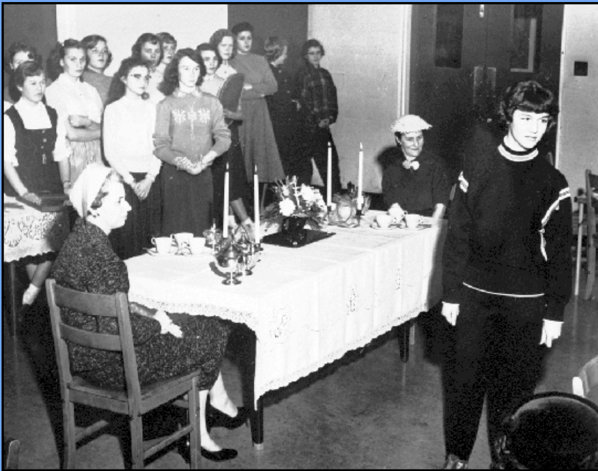
National Archives: Fashion Show and Tea

The Ministry of Health, BC 150 and the BC Care Providers Association have developed this fashion event to help illustrate the cultural connection between our history and our future, our youth and our elders.