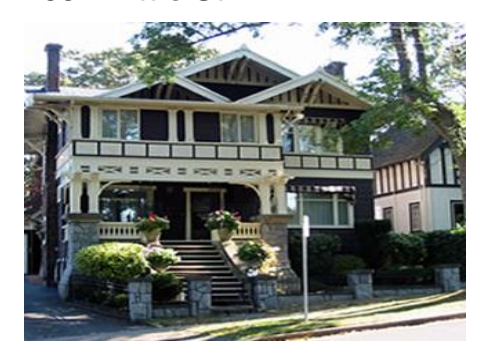
1568 Old Ocean Ave.