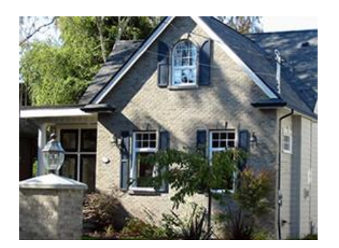
1560 Bittle St.