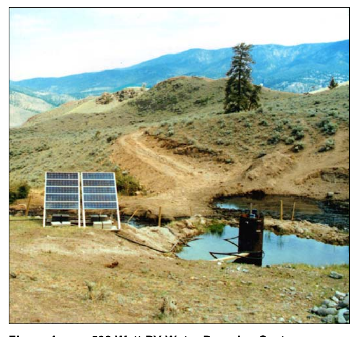
Figure 1 500 Watt PV Water Pumping System

A field installation of a photovoltaic (PV) powered livestock water pumping system is described. The system is designed to supply water to two locations; 3,200 US gal a day at 55 feet lift, or 1,000 US gal a day at 164 feet lift, or a combination of these two lifts and flows. This is sufficient to water approximately 200 or 65 beef cattle respectively. The system was originally funded by Energy, Mines and Resources Canada, together with the B.C. Ministry of Agriculture, Fisheries and Food, and was located in Cache Creek, B.C. in August 1986. The system was moved to Savona, B.C. in the spring of 1989.