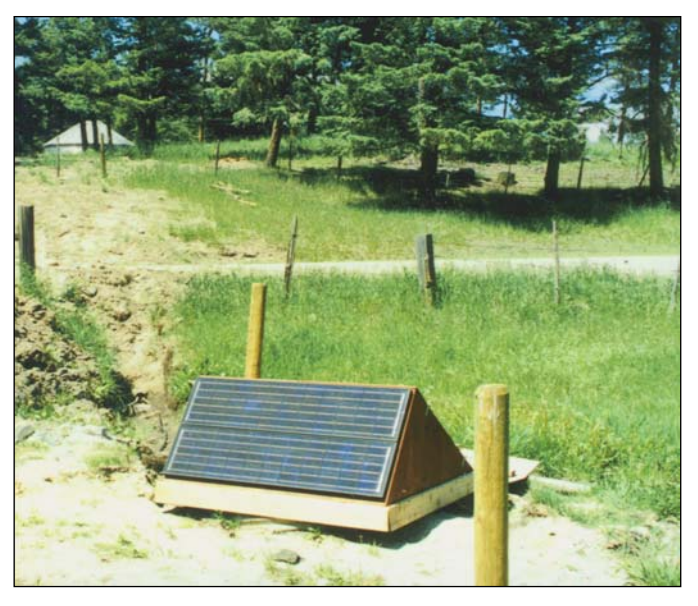
Figure 3 100 Watt PV Water Pumping System

A field installation of a photovoltaic (PV) powered livestock water pumping system is described. The system is designed to supply an average daily volume of 525 US gal pumped to a maximum lift of 32 feet. This is sufficient to water approximately 35 beef cattle. This project was funded by the B.C. Ministry of Agriculture, Fisheries and Food, the D.A.T.E. program and the cooperating rancher, Hugh Fallis, Monte Creek Herefords. It has been operating since 1989.