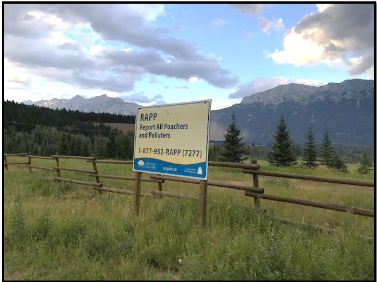
Grave Prairie MVCA – Big Ranch