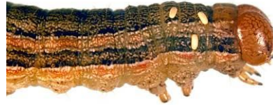
Tachinid eggs on Armyworm