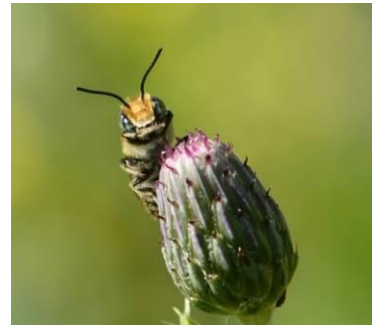
Leafcutter bee ( M. rotundata)