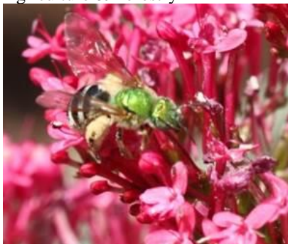
Halictid (Sweat) bee