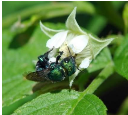
Mason bee ( Osmia sp.)