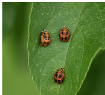
Ladybird beetle pupae