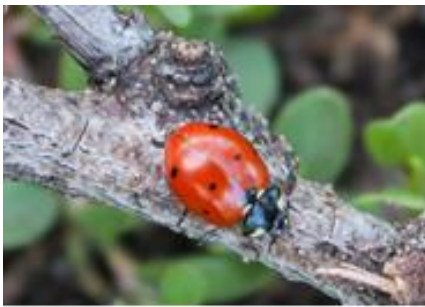
Ladybird beetle adults

Ladybird adults and larvae feed on aphids, whiteflies, scales, mites, mealybugs and other soft-bodied insects. Adults vary in size, colour and pattern depending on the species. Adults can be black, red, and orange-red to almost yellow and may have coloured spots or markings on their backs. Immature stages may look like tiny alligators. Purchasing ladybird beetles for release in outdoor gardens is not recommended as they usually just fly away. However, they can be very helpful in managing pests in greenhouses and solariums.