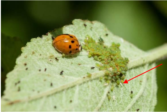
Syrphid fly eggs (red arrow)