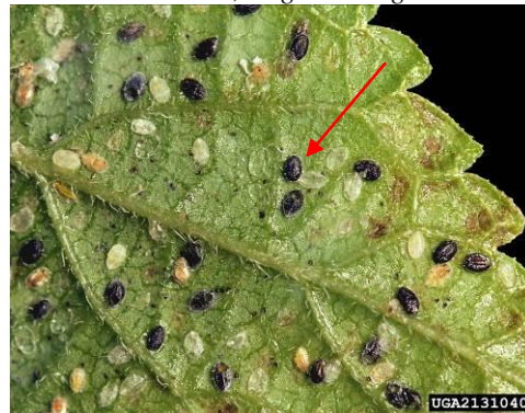
Encarsia Formosa, photo courtesy of David Cappaert, Bugwood.org