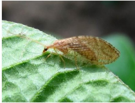
Brown lacewing adult