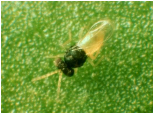
Encarsia formosa, whitefly parasite