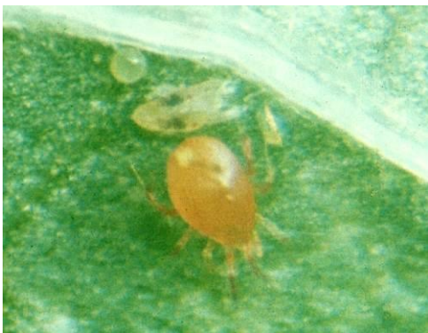
Predatory mite and 2-spotted spider mite

Predatory mites have either small, almost spider-like bodies or red, pear-shaped bodies. Unlike other mites, predatory mites do not feed on plants. Predatory mites also have longer legs and are able to move more actively along leaves and soil as they search for prey. They also do not have wings, segmented bodies or antennae. The predatory mite's special characteristic is its ability to consume large populations of spider mites. Predatory Mites attack and eat most species of spider mites including damaging Red Spider Mites also known as Two Spotted Mites.