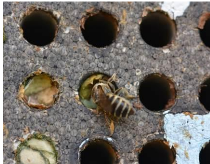
Leafcutter bees ( M. rotundata).