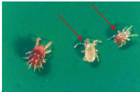
Predatory mites (arrows) with European red mite