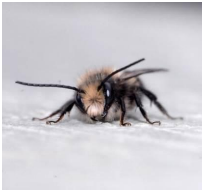
Mason bee ( Osmia sp.)