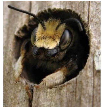
Mason bee ( Osmia sp.)