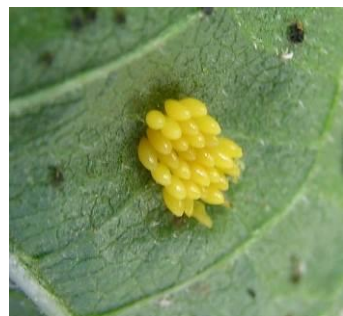
Ladybird beetle eggs