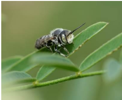
Leafcutter bee on alfalfa ( Megachile rotundata).