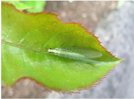
Green lacewing adult

Lacewing larvae feed on aphids and other soft-bodied insects. Adults are light green delicate looking insects with large “lace-like” wings and larvae are flat with big mouthparts extending from the head.