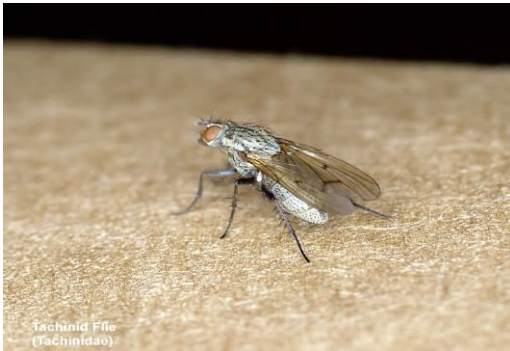
Tachinid fly