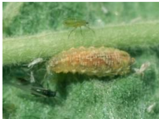
Syrphid larva feeding on aphid