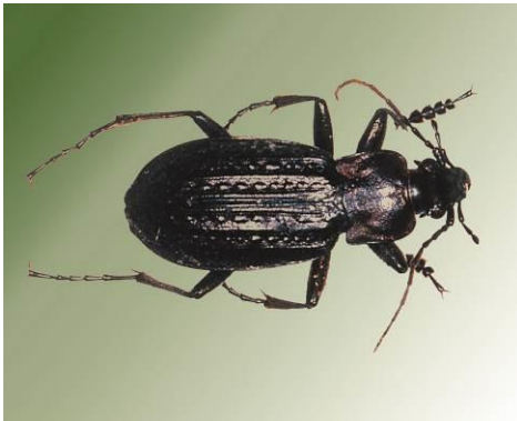
Carabid ground beetle adult

Ground beetle larvae live in the soil and feed on soil dwelling pests such as caterpillars, cutworms and slugs. Spiders and predatory mites are also highly beneficial. Spiders feed almost entirely on insects, and predatory mites feed on plant-feeding pest mites. Ants are predators of many insects, but some protect aphids to feed on their honeydew.