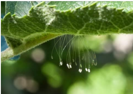
Green lacewing eggs