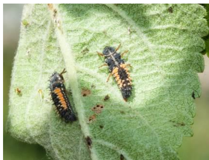
Ladybird beetle larvae