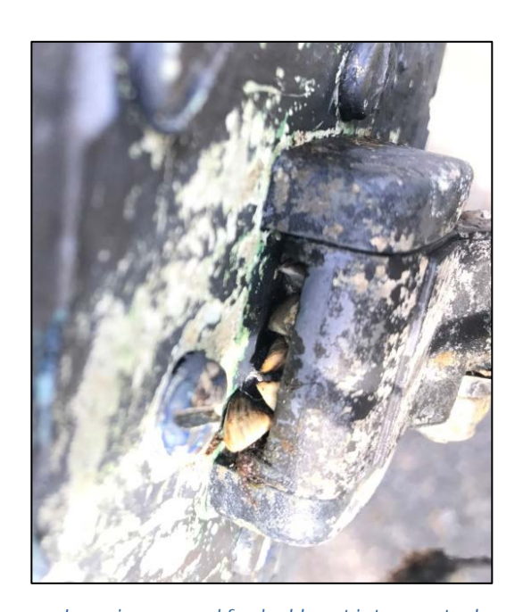
Invasive mussel fouled boat intercepted during the 2017 season.