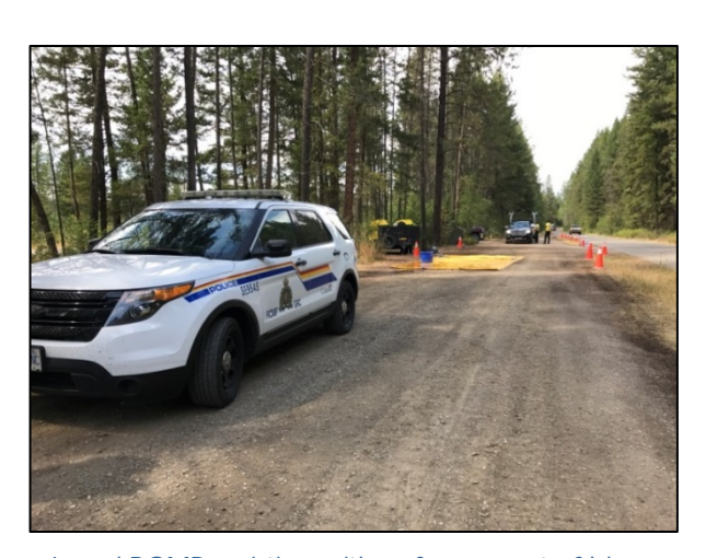
Local RCMP assisting with enforcement of blow by's at the Cranbrook inspection station on Hwy 3.