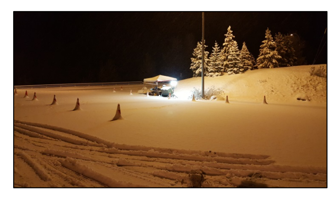
Winter conditions at the Golden inspection station at the end of the 2017 season.

The Program received advanced notification on 20 of the 25 mussel fouled boats either from another jurisdiction (e.g., AB, MT, Idaho, WA) or by Canada Border Services Agency (CBSA). For two of the boats the owners actually contacted the Program in advance to arrange for inspection when they arrived in BC.