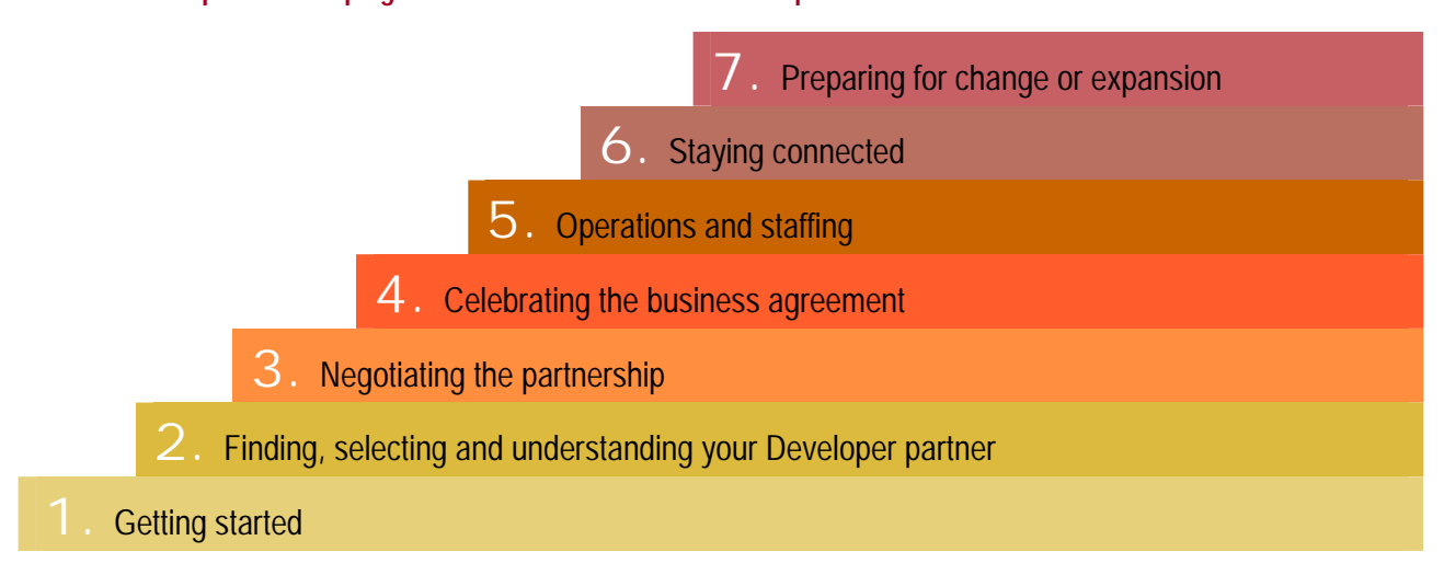
Exhibit 2 – Steps to Developing a First Nation-Business Partnership

There are seven steps to developing a partnership with a resort developer. For the First Nation, the common thread that links each step is the application of its cultural values, principles and protocols.