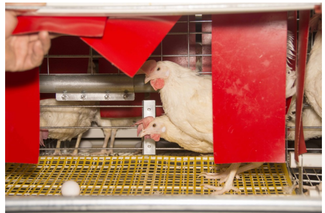
Layers in nesting area of enriched housing.

There is strong growth across all egg varieties (e.g. omega, free range, free run, organic), with classic white and brown eggs representing 86.5% of eggs sold in Canada.