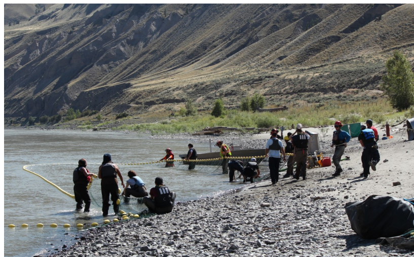
Four seine netting crews are catching fish to transport upstream.