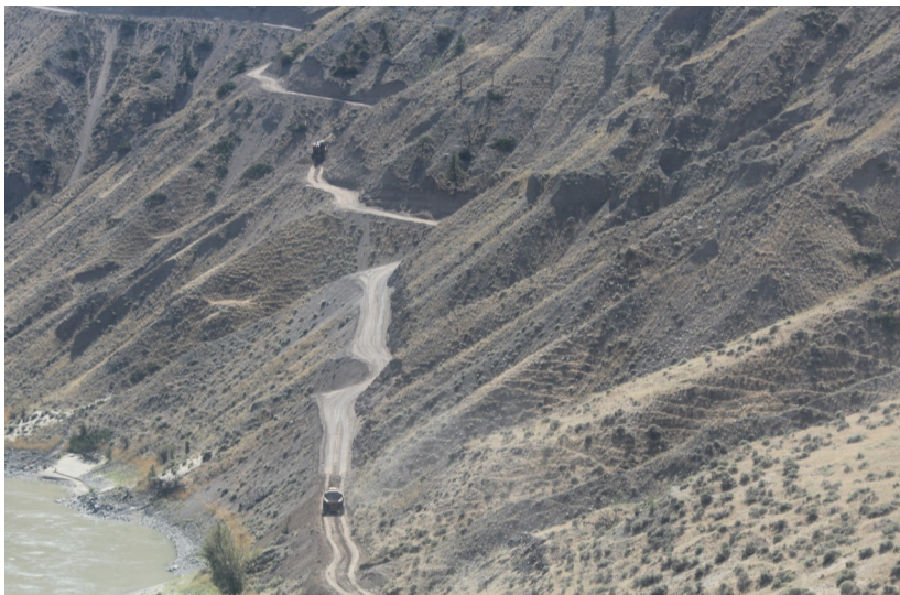
Road improvements are now complete.