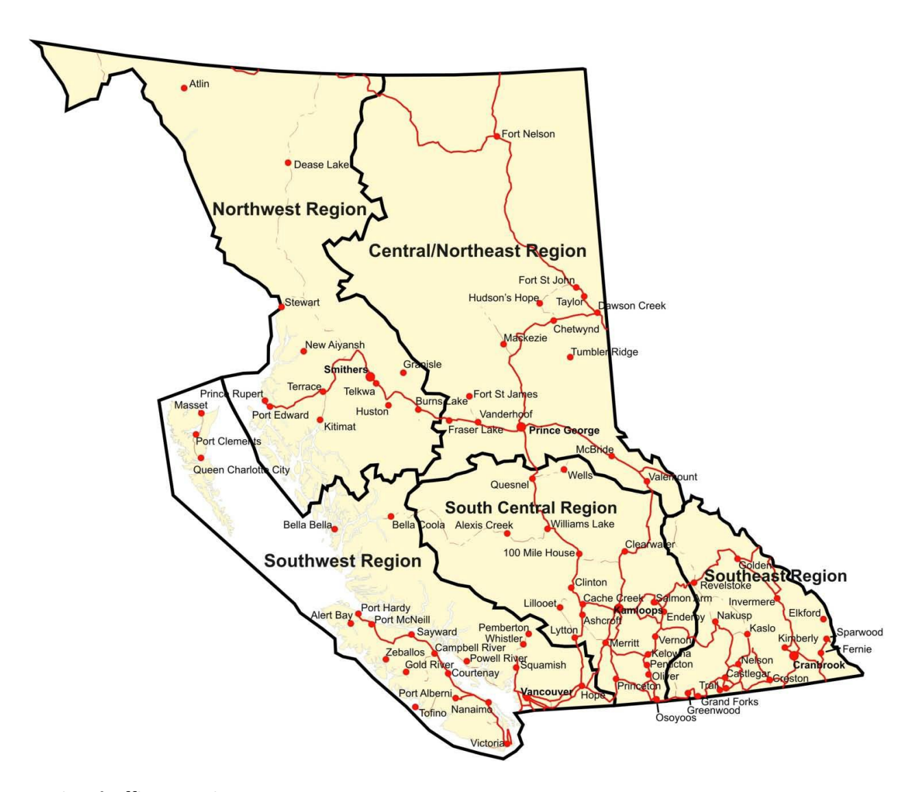
Schedule 2 Mines and Mineral Resources Division Regional Boundaries