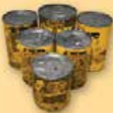
At least a three-day supply of non-perishable food. Manual can opener for cans