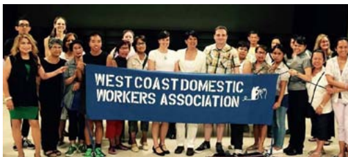
Photo: Members of West Coast Domestic Workers Association at PSA launch event.

On July 30, 2015 a new public service announcement entitled "End Labour Trafficking" was launched by West Coast Domestic Workers Association to mark the World Day Against Trafficking in Persons as part of the Prevention of Labour Trafficking Project with support from Public Safety Canada. The project's aim is to provide awareness and education about the crime of trafficking in persons for the purpose of labour exploitation in B.C. with a focus on migrant workers. The project will also produce an in-depth documentary capturing the voices and stories of those trafficked for their labour in B.C. and Canada. For more information, see the public service announcement .