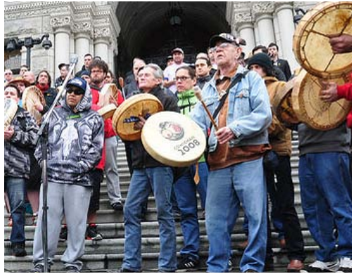
Photo: Moose Hide Campaign's Men's Gathering in February 2015.