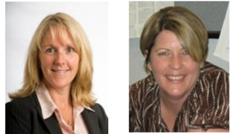
Photo 3: IOM Project Managers