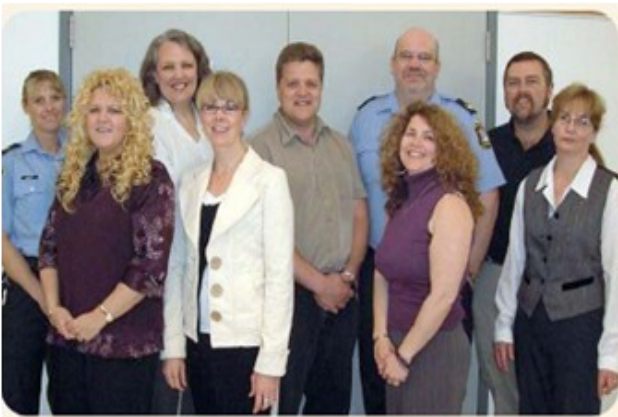
Photo 2: 2008 IOM Team Case Co-ordinators.