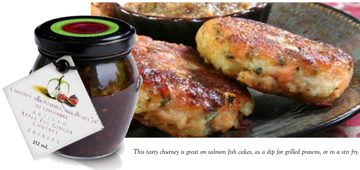
This tasty chutney is great on salmon fish cakes, as a dip for grilled prawns, or in a stir fry.

This Apple Fig Ginger Chutney ($999840601, $10.50) bursts with the unique flavour combination of apples, figs, fresh and candied ginger, and spices. Enjoy it with cream cheese on crackers, spread it in a panini, spoon it over melted brie, enhance a curry dish, or use it on paneer fish cakes (recipe below). Paneer is a fresh cheese of Indian origin and is common in South Asian cuisine. Unlike other cheese, it does not contain rennet, making it completely lacto-vegetarian. You can find paneer in a grocery store or try making it yourself with the recipe below.