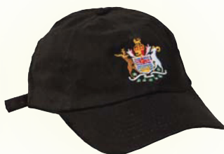
Coat of Arms Baseball Cap $22.95