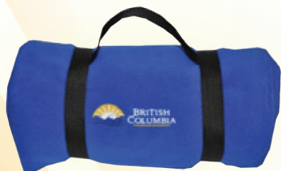
Blanket with Carrying Strap $21.95