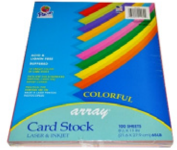
Card Stock Paper Vibrant Colours