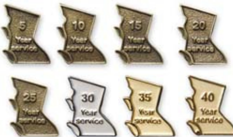
Long Service Award Pins