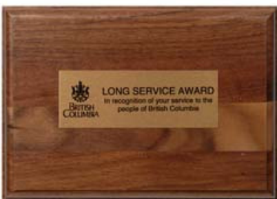
Long Service Award Plaques

Remember to also order 5, 10, 15, 20, 25, 30, 35, 40 year service pins.