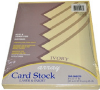
Card Stock Paper Ivory