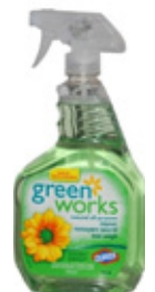
Green Works Natural cleaner 7920014022