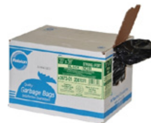
Eco friendly garbage bags 8105261007