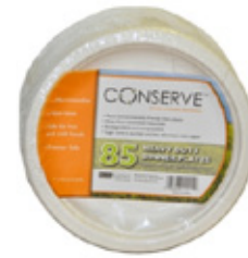
Sugar cane plates 7920015205