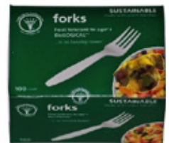
Bio plastic forks 7920015007