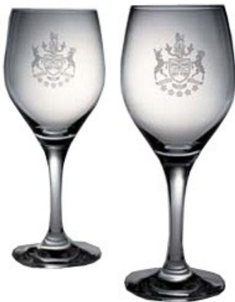
Coat of Arms Wine Glasses #9999841034, $39

With a rich wood grain finish these desk accessories will add style to your workplace. Conveniently matching the WoodTones mahogany products are two Roman numeral desk clocks with gold accents. The Ergo Clock Desk Set makes a stately piece with two black ink gold pens framing the clock. The Ergo Round Desk Clock features a solid wood case and skeleton movement. Founded in 1966, Ergo has grown in Canada's premier manufacturer of specialty clocks.