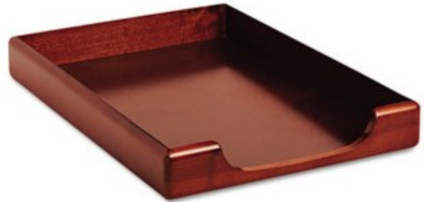
Rolodex WoodTones Front Load Tray #7520361095, $14.50

The desk accessories include business card holders, pencil cups, paper clip holder, and letter trays. They feature non-skid feet to protect furniture and softly rounded edges for a contemporary look. The paper clip holder has a magnetic top to keep paper clips within reach. The desk organizer has four compartments to hold your favourite writing instruments, important pieces of paper, and smaller supplies such as push pins and elastic bands.