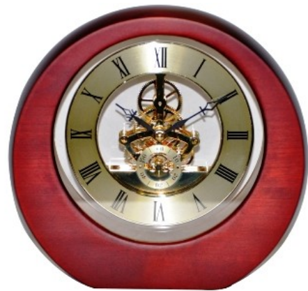
Ergo Round Desk Clock #9999840752, $64.95

Now that your workplace has added elegance, why not makeover your boardroom? The DCV has brand new old fashion glasses in that feature the B.C. Coat of Arms. The glasses are presented in a black box and match a large and a small B.C. Coat of Arms water jug. Wine glasses are also available with a laser etched B.C. rising sun logo or B.C. Coat of Arms. The items add class to meetings and are a must-have for any boardroom or executive office.