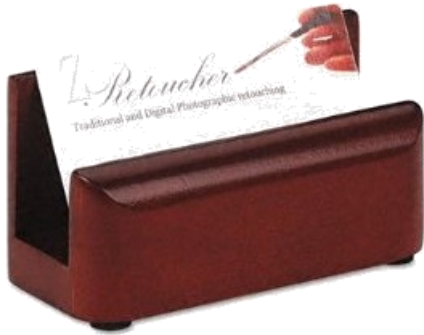
Rolodex WoodTones Business Card Holder #7520363017, $4.55

When you think of managing your business cards, you probably think of Rolodex. For more than 50 years the company has helped to keep important numbers, business cards and papers at your fingertips. The new WoodTones desktop accessories combine classic designs with a contemporary wood finish for a warm, elegant feel. The DCV has a variety of the new WoodTones products, which are available in matte black and mahogany.