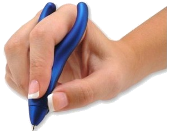
Ergo Soft Pen, #7520602120, $3

Check out the new arrivals section in the DCV Online Store to see what exciting and innovative products have just come in!