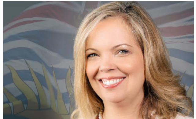
Honourable Coralee Oakes, Minister of Small Business and Red Tape Reduction