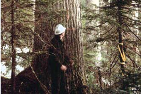
An exceptionally well-formed western hemlock on a moist, medium SNR, montane site in the Coast Mountains