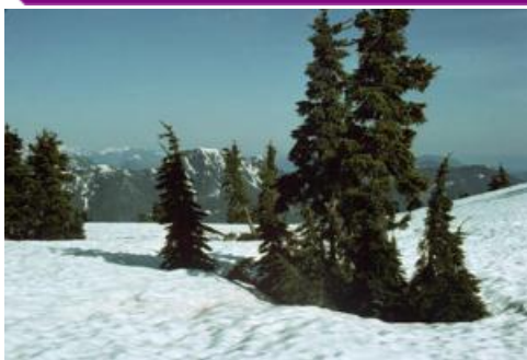
Mountain hemlock is characteristic of the coastal subalpine forest of western North America. This picture shows a tree island of mountain hemlock in the upper southern maritime MH parkland in early spring in the Coast Mountains.