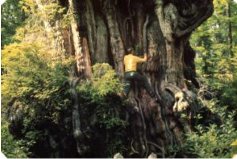
Western redcedar is one of the most valuable tree species of B.C., considering its ecological, silvical, timber, and cultural values. This picture shows an extraordinary western redcedar tree in the coastal rain forest.