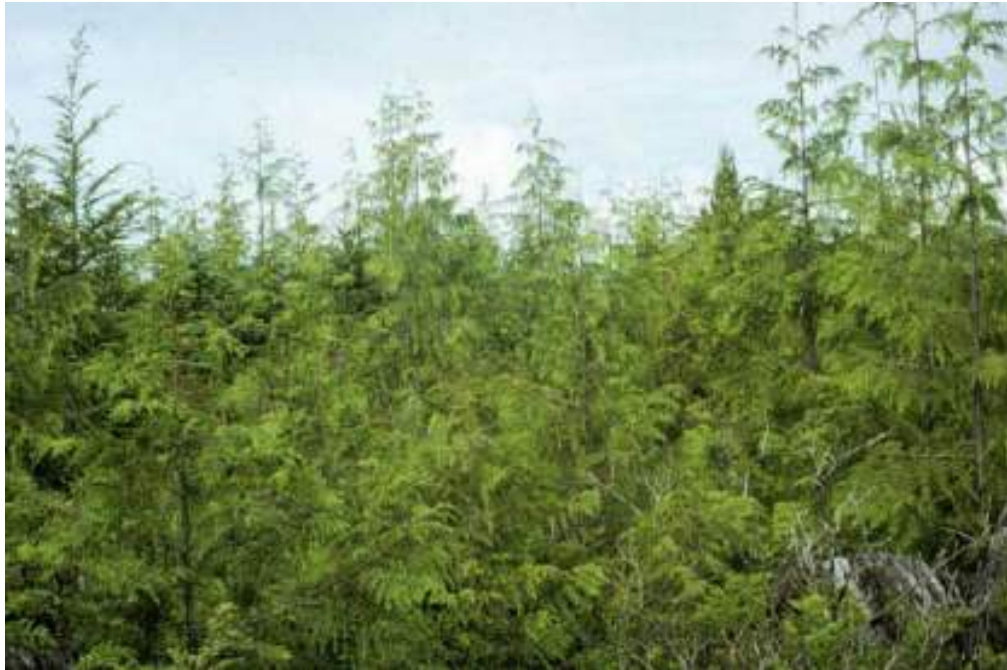
Figure 5. Pure even aged redcedar stand that is on a trajectory to provide desired characteristics.

objective. Will other approaches create similar desired outcomes? To some extent time will provide the conditions that create clear wood and large trees. The assumption is that most stands will have some healthy cedar and with enough time the trees will provide for the desired characteristics. When natural regeneration is relied upon in areas of low ground disturbance, much of the regeneration will be vegetative and have internal rot, this may not be a wise assumption.