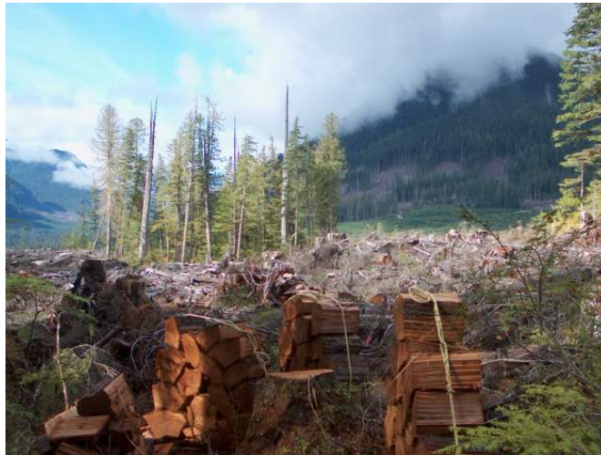
Figure 2. Cedar bolts to be used for shingles or shakes. Note the retention of redcedar in the group behind. Second growth trees will not have the characteristics of these large old trees, no matter how they are grown, unless rotations are lengthened.

The aesthetic quality of redcedar is often derived from its reddish color, grain pattern and wood free from knots. Similar to the issues on durability second growth redcedar will often have reduced heartwood and have limited clear wood unless managed specifically to create these desired characteristics of grain and color.