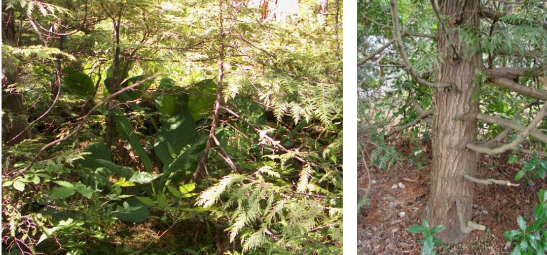
Figure 4. Note the wide low crown extending to the ground in the understory redcedar. Also note the size and longevity of branches in an open grown redcedar on the right. This form does not promote the growth of clear wood or the creation of Monumental Cedar characteristics desired by many coastal First Nations.