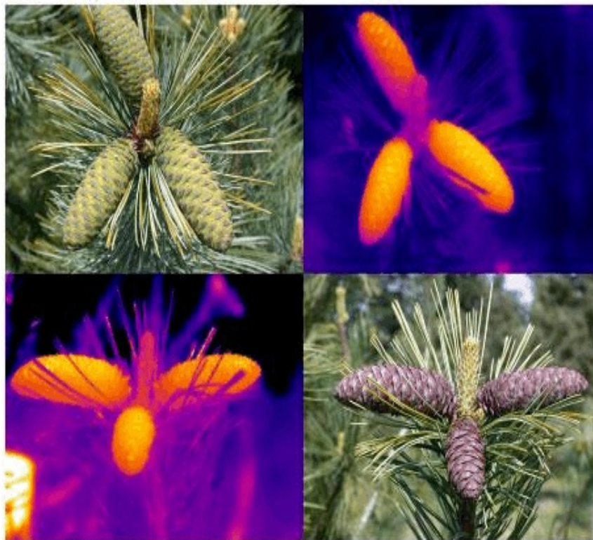
Figure 1. Paired photographic and thermographic images of western white pine cones at Sechelt Seed Orchards.

In conclusion, this fascinating work has demonstrated, for the first time, that developing conifer cones emit IR and that L. occidentalis seed bugs exploit this as a cue when foraging for food resources. The implications of this with respect to the foraging behaviour of other plant-feeding insects are now being explored. More importantly, as far as conifer seed production is concerned, we finally have a real tool with which to develop an effective seed bug population monitoring and management program. Work is continuing at the Gries lab.