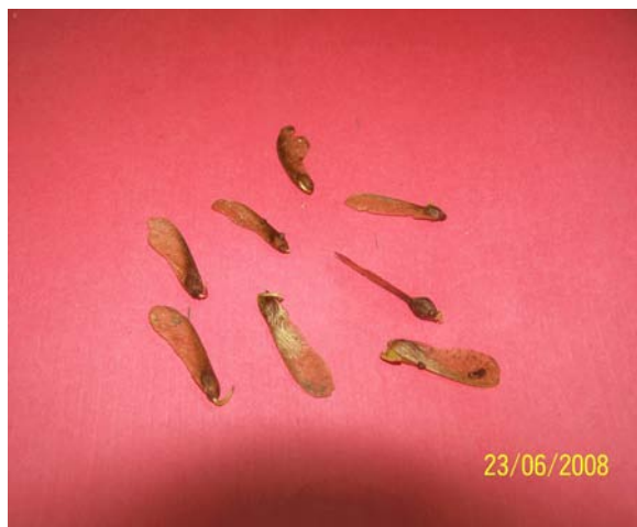
Figure 1. Acer freemannii seed.

Morphologically, hybrid maple seed looks very similar to one of its parents, silver maple, except for size (Fig. 1). Its germination behaviour was also like silver maple because the non-dormant seed completed germination in 10 days (Figs. 2 and 3). However, hybrid maple seed could tolerate drying to a moisture content of 6% (embryo and cotyledons). That means its storage behaviour could belong to the orthodox or intermediate category. If this is the case, then hybrid maple seed may have the capability of being stored at sub zero temperatures. However, the results of this trial are based on only a small seed sample from one parent tree in one seed crop year. Further study is required to confirm these results.