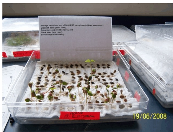
Figure 2. Germination of Acer freemannii after seven days.