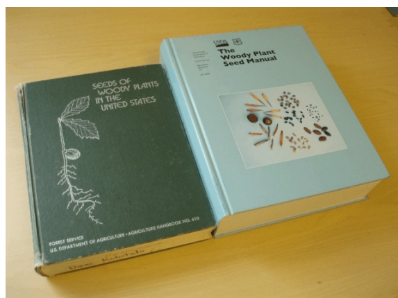
Figure 1. A comparison between the 1974 and 2008 USDA Agriculture Handbooks dealing with Seeds of Woody Plants.