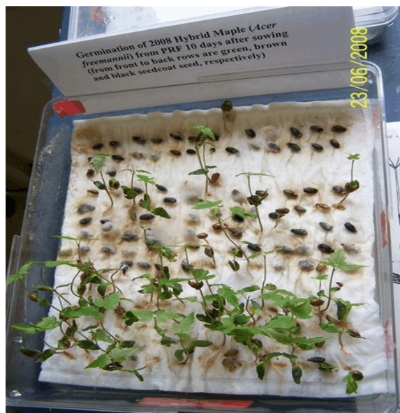
Figure 3. Germination of Acer freemannii after ten days.