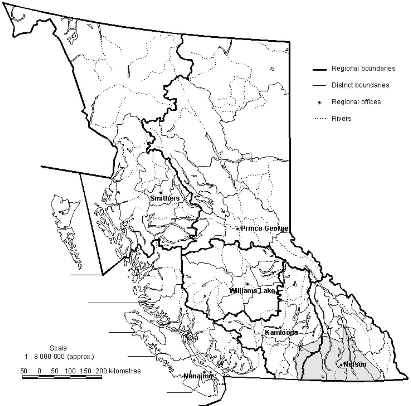
Figure 3. Western larch dwarf mistletoe ( Arceuthobium laricis ).