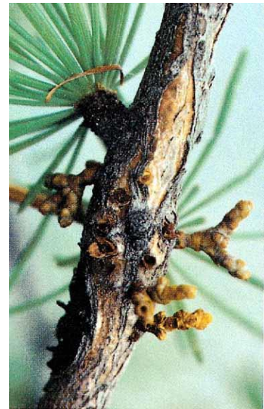
Larch dwarf mistletoe, Arceuthobium laricis