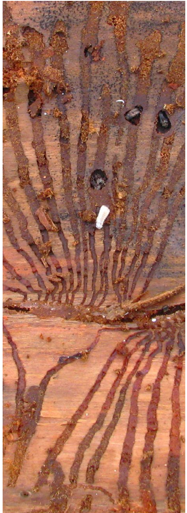
Figure 8: Douglas-fir beetle "galleries" under the bark, indicating that the tree is infested and should be removed from the property to minimize the beetles' spread the following year.