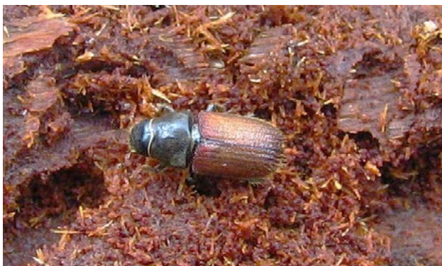
Figure 1: Adult Douglas-fir beetles are dark brown and black and are 4.5 mm to 7 mm long.

Douglas-fir beetles usually prefer to attack trees with a diameter over 20 cm, but they will attack smaller trees when the beetle population is high. They are also attracted to high stumps and slash piles.