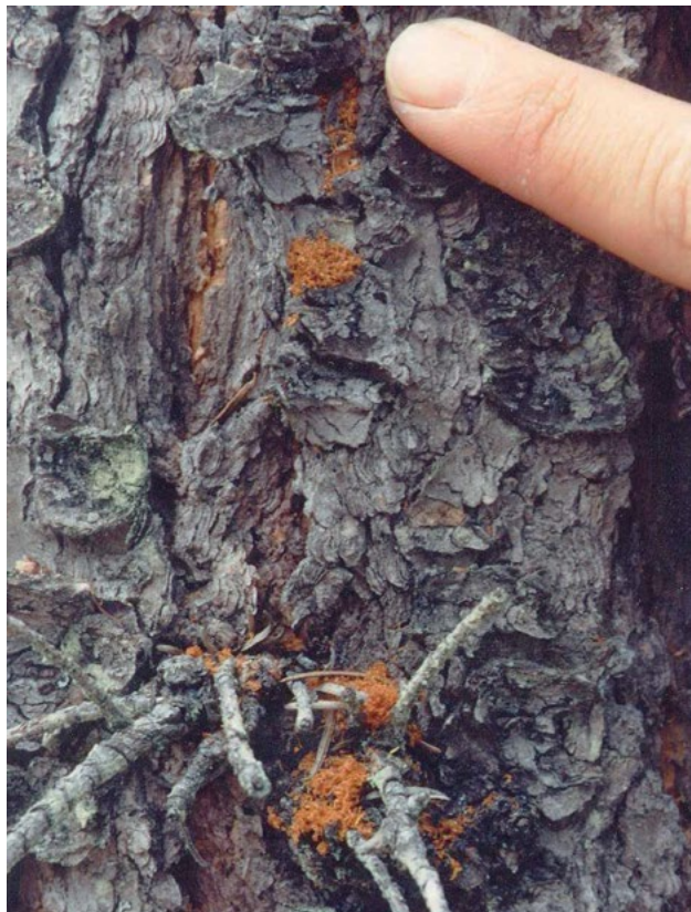
Figure 4: Frass (fine sawdust) on a tree trunk, an indication that beetles have bored into the tree.