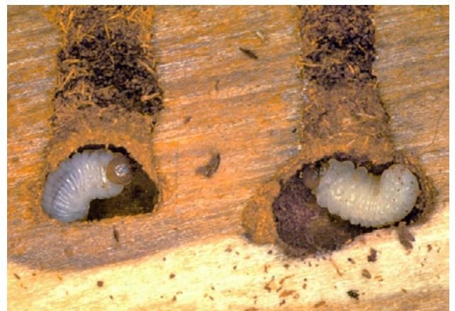
Figure 2: Douglas-fir beetle larvae.