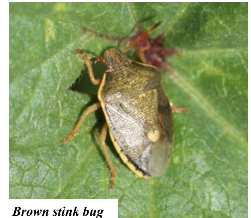
Brown stink bug