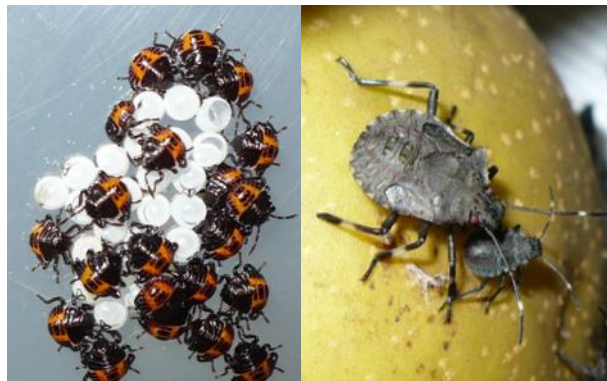
Left, newly hatched brown marmorated stink bug nymphs with egg mass; Right, second and fifth instar nymphs.

Immature stages do not have fully developed wings and range in colour from bright orange to red, black or brown; later stages are pear-shaped with white markings on legs and antennae.