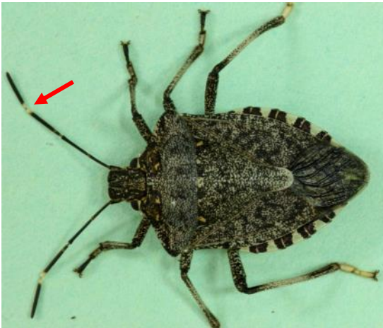
Adult brown marmorated stink bug. Note white bands on antennae.

It feeds on more than 100 different plant species including tree fruits, berries, grapes, vegetables, and ornamental plants.