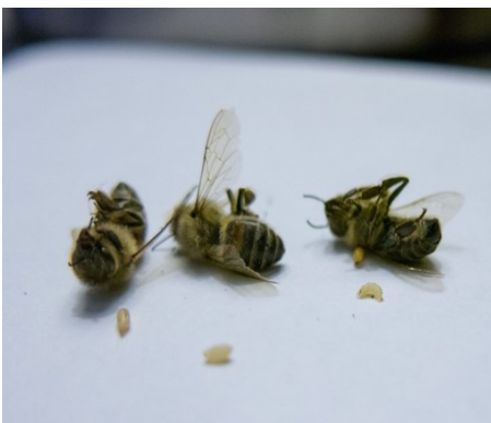
A. borealis larvae and pupa on parasitized honeybees

High population turn-over is a natural phenomenon as bees die of old age, disease, environmental pollutants, inclement weather, beekeeper mismanagement and due to predation and hazards in the field. Field hazards include exposure to predatory wasps, inclement weather, spider webs and crab spiders, traffic road kill and phorid fly predation.