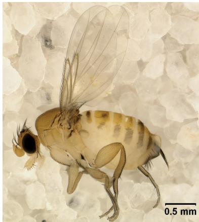
A. borealis , adult female

The common theme of the Zombie Bee phenomenon was of adult honeybees being attracted to porch lights at night where they displayed abnormal motor coordination, exhaustion and death.