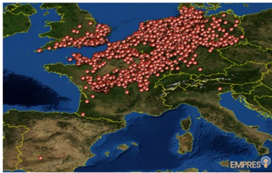
Distribution of SBV by the end of April 2012. Map produced using EMPRES-i, Global Animal Disease Information System < http://empres-i.fao.org/eipws3g/#h=0 >

Since then, hundreds of cases in sheep, cattle and goats have been found with similar signs. Some affected animals also have severe diarrhea. The symptoms in adult animals are self-limiting, but have led to abortions, stillbirths and congenital malformations in newborns of animals infected during gestation. The malformations include arthrogryposis, jaw deformities, torticollis, and dome-shaped head (predominantly seen in newborn lambs). Neurological signs were also observed: ataxia, blindness and inability to suckle.