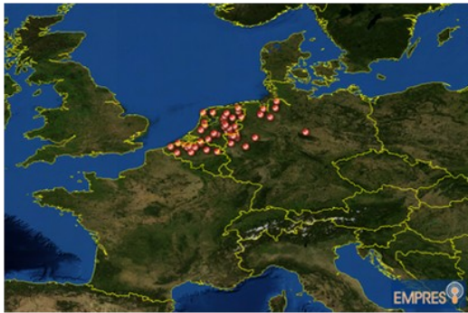
Distribution of SBV by the end of December 2011. Map produced using EMPRES-i, Global Animal Disease Information System < http://empres-i.fao.org/eipws3g/#h=0 >

A new emerging virus, Schmallenberg virus (SBV), was identified in November 2011 at the Friedrich Loeffler Institute (FLI), the German federal animal health laboratory. The disease was first seen in the summer of 2011 in Germany in dairy cows that displayed symptoms of fever, poor body condition, inappetence, and reduced milk production.