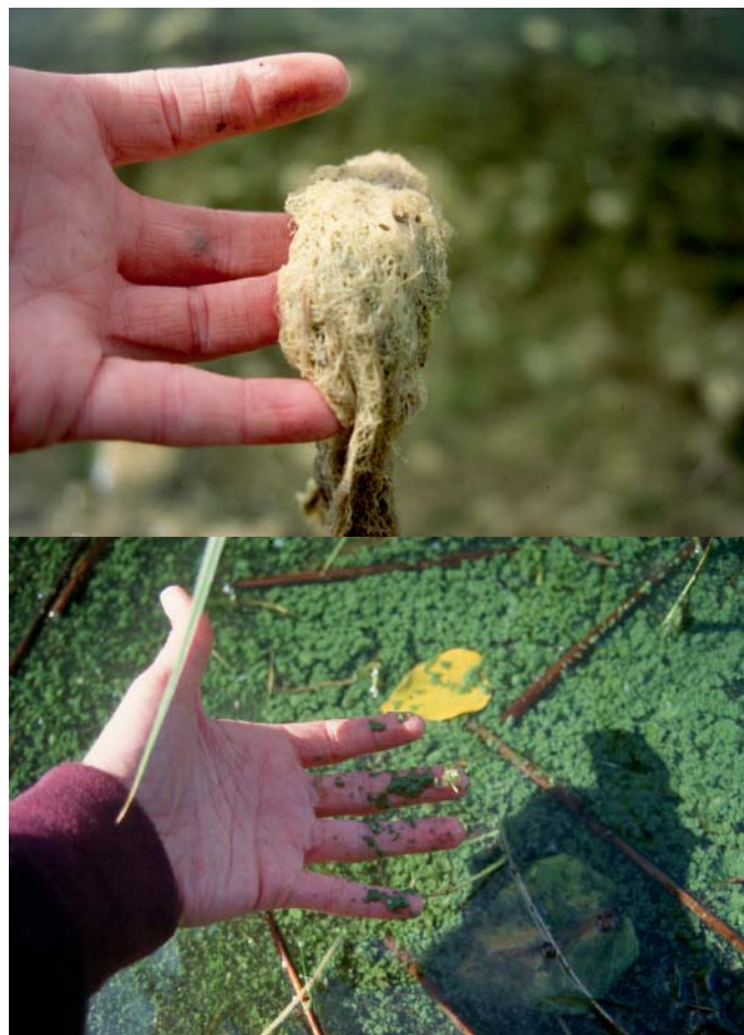
Top: Example of a filamentous green algae bloom

**CAUTION: this is not a fail-safe method of identification. A qualified person should always be consulted for positive bloom identification. A