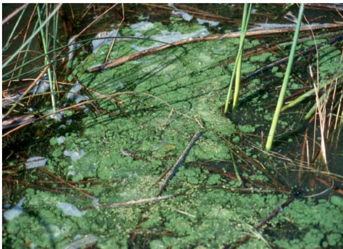
Cyanobacteria often clump together, particularly under calm conditions

Some species of algae can produce planktonic blooms. An example is diatoms that usually bloom in the spring, colouring the water shades of brown. A film of brown sludge on river rocks in early spring is usually left by diatom colonies. Euglenoids create a powdery film on the water's surface; some can turn the water bright green, similar to that of antifreeze. In intense light, euglenoid blooms shift from bright green to bright red, a pigment response to ultraviolet light stimulation.