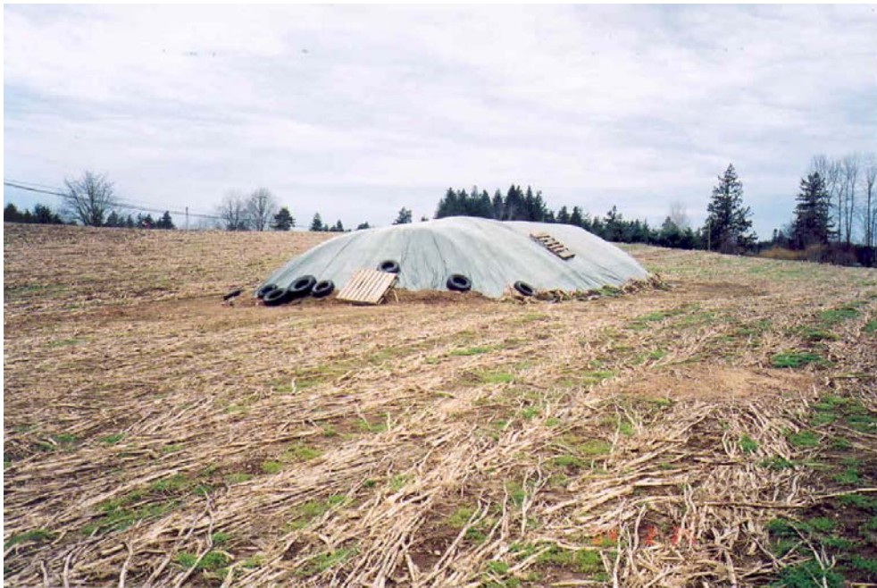
Figure 5: Good Practice - Manure covered with a tarp to prevent rain from causing leachate seepage and contaminated runoff. Heavy objects are used to prevent the tarp from being blown off by wind. Storage pile is well away from any watercourses (February 25, 2004).

Thirteen different commodity types were assessed, however, only horse, cattle, pasture/forage, poultry and berry were of a sample size large enough to make preliminary statements regarding compliance rates of various commodity types (Table