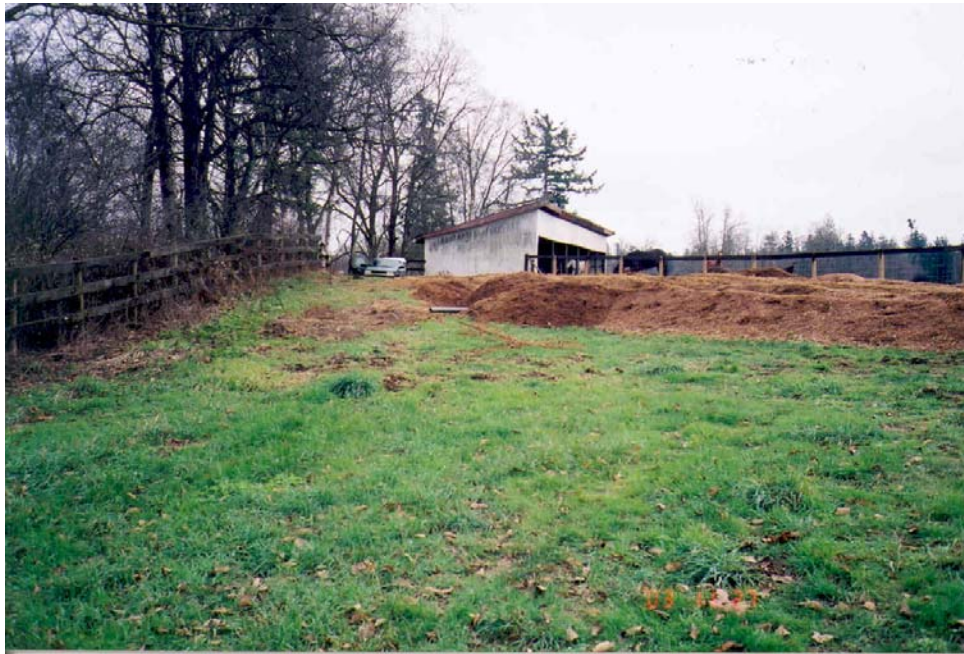
Figure 3: Poor Practice - Manure pile not covered with a tarp during the wet season from October 1 to April 1. Also, a pipe has been installed through the manure pile to drain a horse pasture area. This allows contaminated runoff to flow into the watershed of a sensitive creek located near the trees to the left. (November 27, 2003).

test their manure or soils, respectively, for nutrient levels (Appendix D). In addition, only 12% of the farms consulted with a qualified professional regarding crop nutrient requirements and nutrient application rates. The Ministry believes that these numbers will have to increase in order for more responsible nutrient management to occur and for agricultural byproducts to be recognized as having intrinsic value as opposed to simply a waste. The EFP program would be an excellent method for increasing the awareness of the value of agricultural byproducts which should lead to improved management.