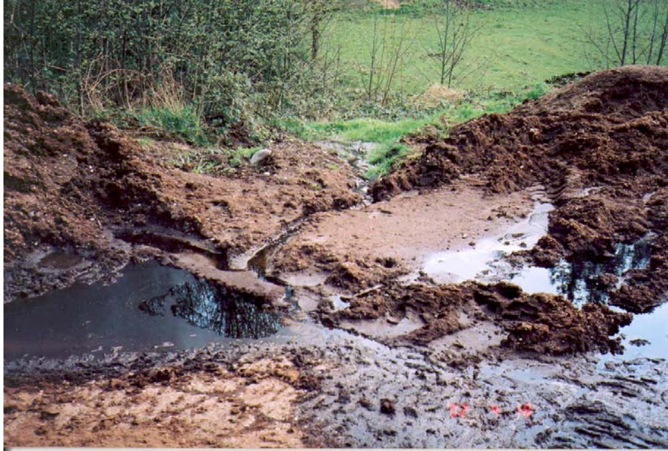
Figure 4: Poor Practice: Uncovered manure/compost causing leachate which flows to a creek that leads to fish-bearing waters (General File Photo).