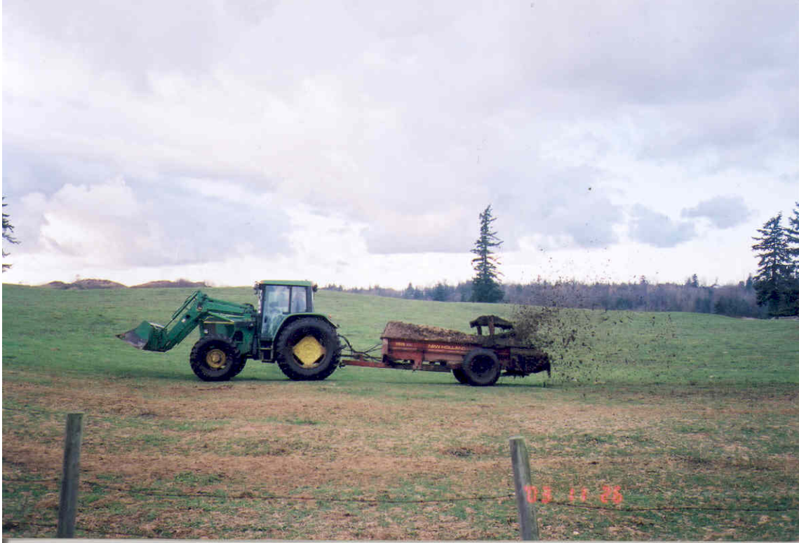
Figure 6: Poor Practice - Manure is being spread during the wet non-growing season when contaminants can leach into the groundwater table or run off into fish-bearing waters instead of being taken up by crops that require nutrients for growth.

At six (19%) of the complaint sites, agricultural waste was directly discharged to the environment. One complaint site was found to be out of compliance with the requirements for proper disposal of mortalities.