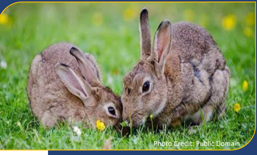
REPORT INVASIVE SPECIES Download the App!

European rabbits compete with many native species for food and shelter. Their intense grazing and burrowing behaviours also cause considerable soil erosion.