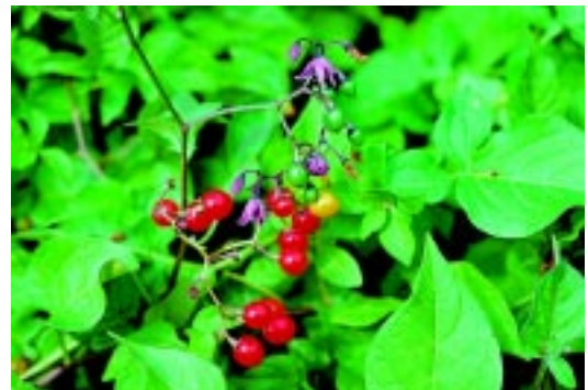
EUROPEAN BITTERSWEET IS A COLOURFUL INTRODUCED NIGHTSHADE VINE THAT INVADES RIPARIAN AREAS AND OUTCOMPETES NATIVE PLANT SPECIES.