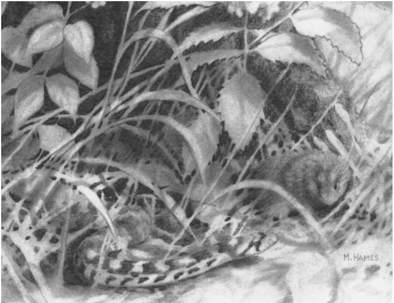
UPLAND SPECIES SUCH AS GOPHER SNAKES ALSO DEPEND UPON COTTONWOOD ECOSYSTEMS FOR COOLING SHADE AND FOR FOOD.

tree growing on these wet sites, it is certainly not the only one. Water birch, paper birch, trembling aspen, ponderosa pine, Douglas-fir, and mountain alder may also be found in these forests. In most cases, these forests support a dense and diverse collection of understory plants, especially shrubs. In the warmest ecosystems, one finds shrubs such as common snowberry, Douglas maple, red-osier dogwood, and Nootka rose. On less hot and dry sites, the shrub layer typically contains saskatoon, tall Oregon-grape, chokecherry, Bebb's willow, black hawthorn, poison-ivy and sumac, as well as white clematis and blue clematis.