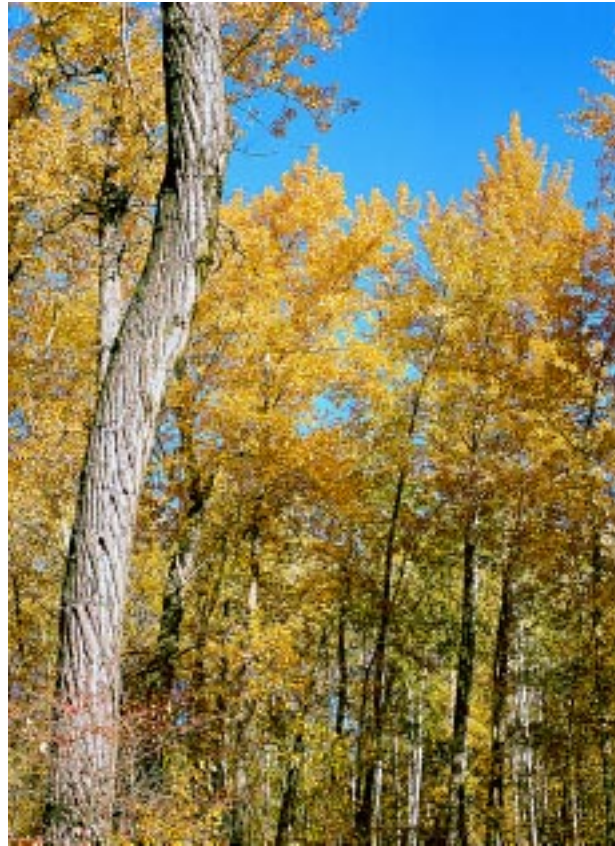
IN AUTUMN, THE GOLDEN FOLIAGE OF COTTONWOODS ADD COLOUR TO THE MUTED TONES OF THE SURROUNDING LANDSCAPE.

Fortunately, the ecology of cottonwood ecosystems makes them excellent candidates to recover from disturbance. Research in adjacent regions has shown