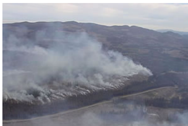
Figure 1: Large scale forestry open burning of piled debris

Burning can be considered a legitimate management tool, as in the case of certain land management objectives, or simply as an easy method of waste disposal. In B.C., resource management open fires are regulated by the Wildfire Act and Regulation whereas open burning for waste disposal is regulated either through the Open Burning Smoke Control Regulation or through permits, approvals and solid waste management plans.