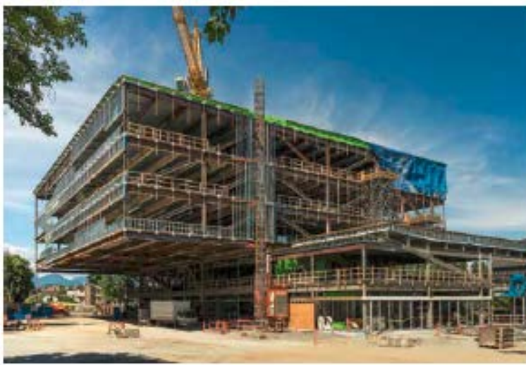
Langara Science Building Construction