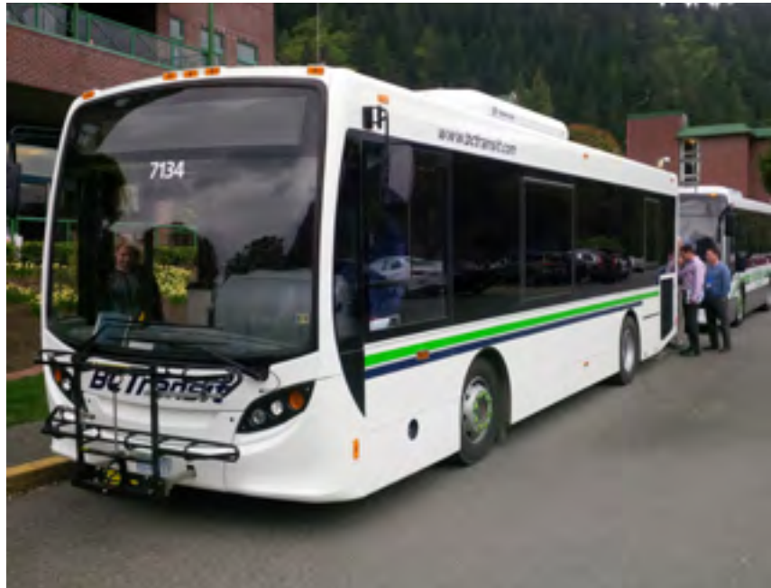
Right size bus option – January 2014 MiDI Bus Test