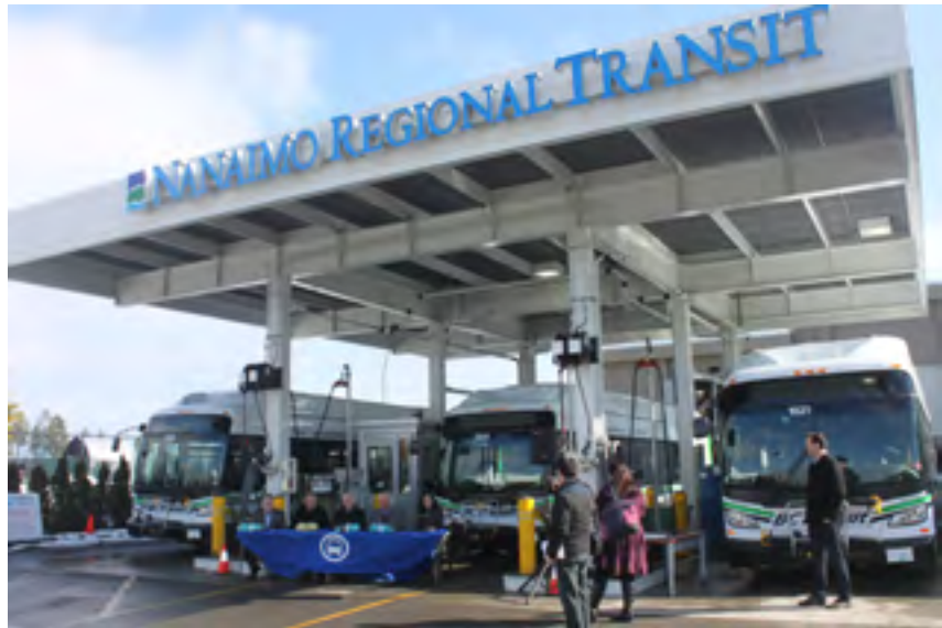
CNG Fueling station with CNG buses in Nanaimo

As required by section 5 of the Carbon Neutral Government Regulation, 62,665 tonnes of CO 2 e of emissions resulting from the operation of transit buses was reported as part of our greenhouse gas emissions profile in 2014. However, they were not offset as they are out of scope under section 4 (2) (c) of the Carbon Neutral Government Regulation.