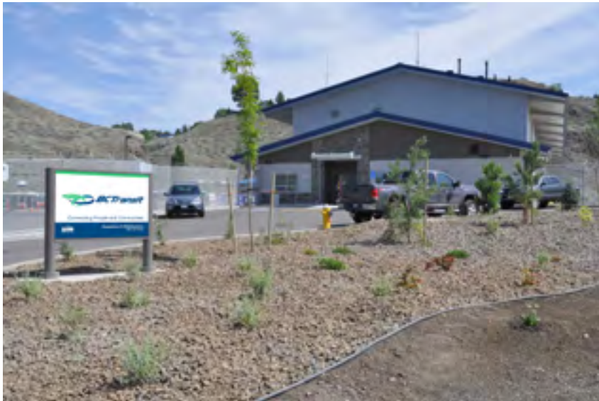
Kamloops Transit Centre Facility

Facilities GHG emissions declined by 5% in 2014. This is despite the addition of the Nanaimo CNG compression station to our fixed asset portfolio. This reduction was primarily a result of continued efficiency improvements at the Victoria Regional Transit facilities, notably HVAC and lighting upgrades at Victoria Transit Centre, lighting upgrades at the Commerce Circle Transit Centre as well energy efficiencies in other Regional Transit Systems, for example lighting upgrades at the Campbell River Transit Centre.