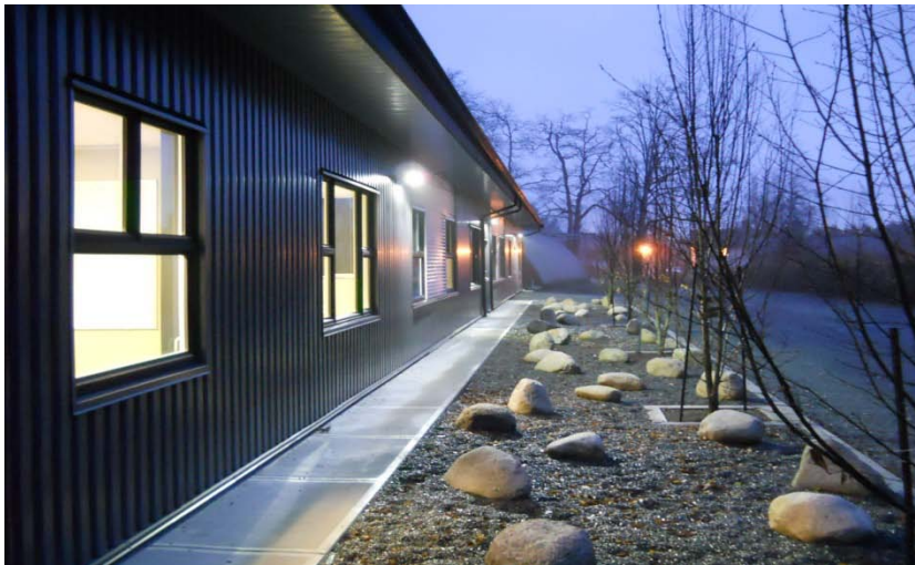
New Facilities Office and Trades Shop