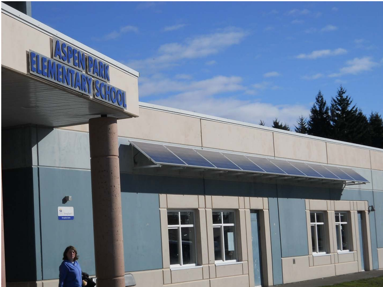
Aspen Park Elementary Solar Grid Tie Comox Valley SD71