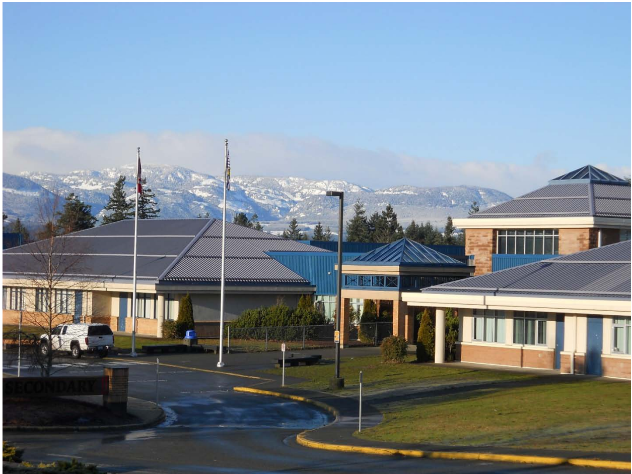
Mark Isfeld Secondary School Comox Valley