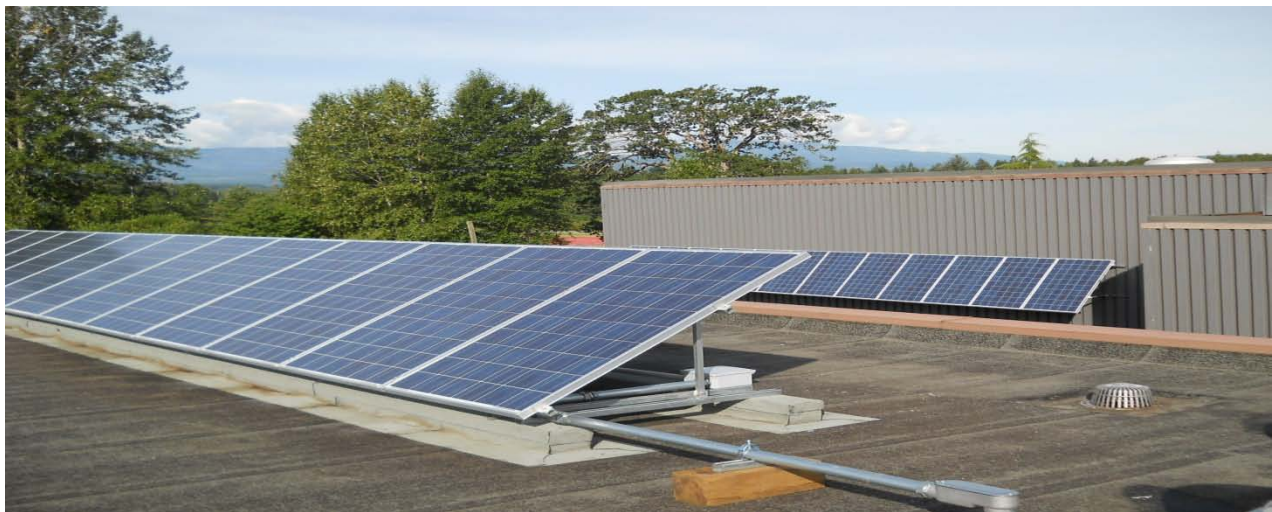
GP Vanier 5kW solar Grid Tie (expandable to 8kW)