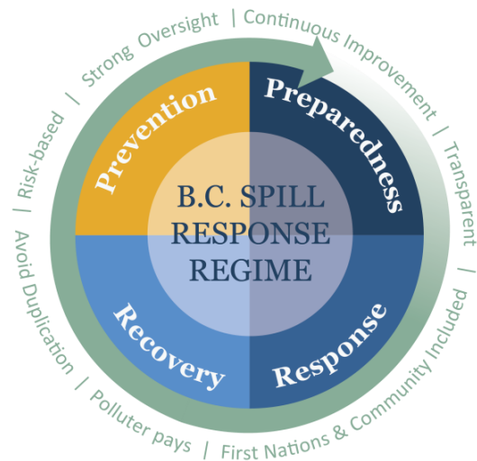
Figure 1: B.C. Spill Response Regime Design Principles

To date, the ministry has published and received public input on two intentions paper and recently announced an engagement period for a third intentions paper called Spill Preparedness and Response in BC – Proposed Amendments to the Environmental Management Act and Proposed Regulations (IP3) . The IP3 summarizes proposed amendments to the Environmental Management Act passed in the Legislative Assembly in May 2016 and lays out the ministry’s intent for regulatory and policy changes. The new legislation provides the legal foundation to establish a new preparedness and response regime for addressing environmental emergencies in B.C.